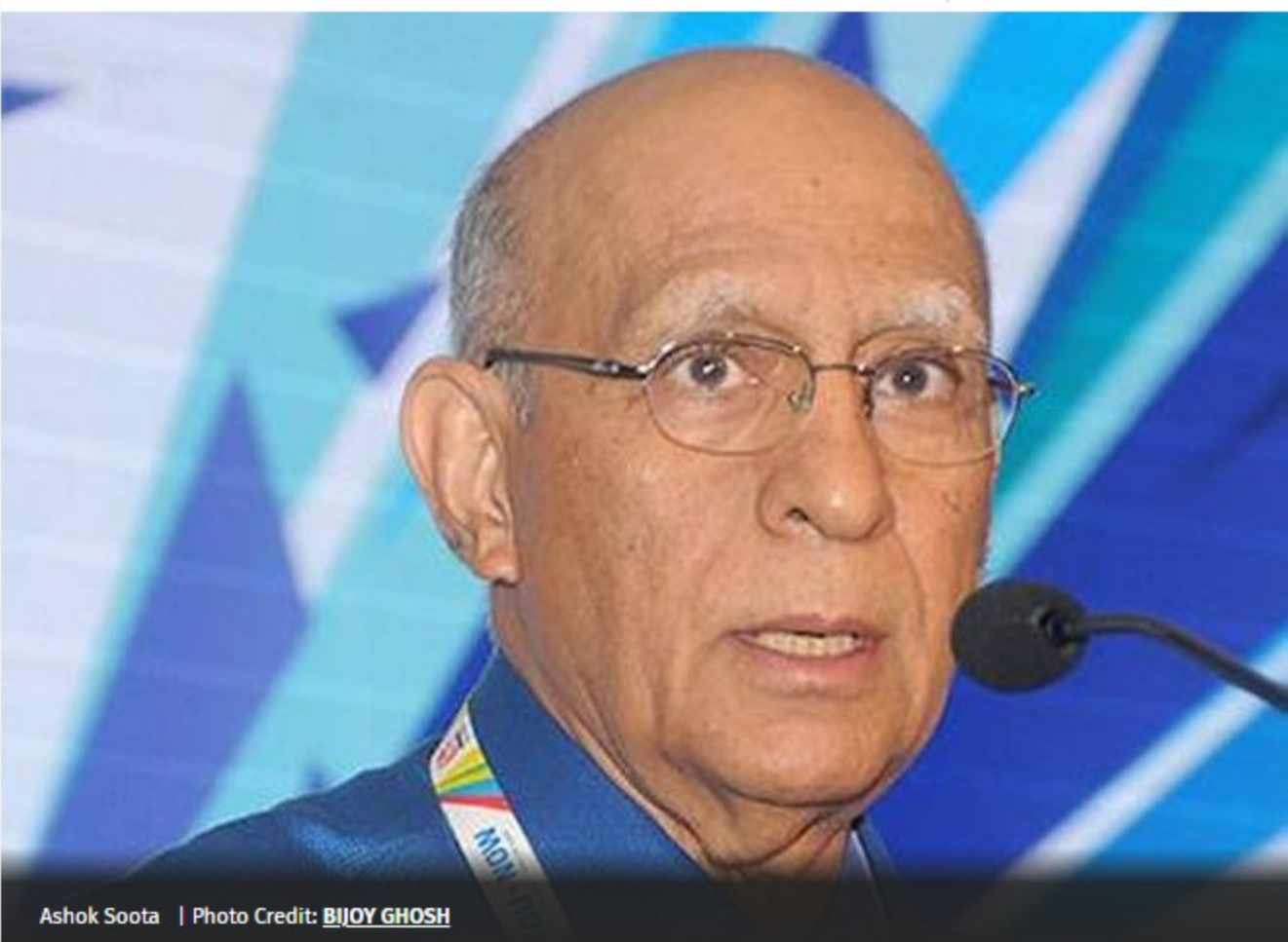
Ashok Soota